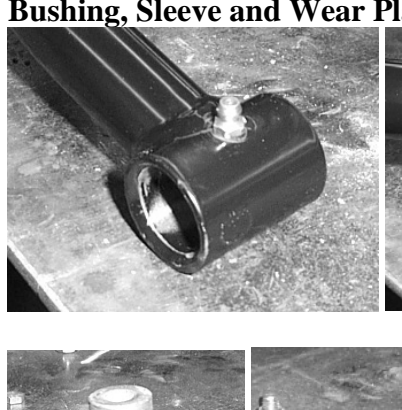
Bushing, Sleeve and Wear Plate

6. Now reinstall the bushings, sleeves, and ball joints into the new arms. If you place some grease on them it makes the installations easier.