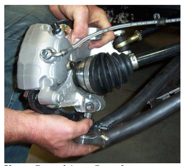
Upper Control Arms Second: