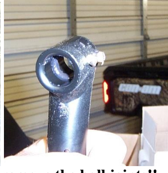
NOTE: You will need a press to remove the ball joints!!