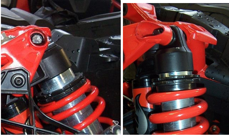
4) Disconnect the shock from the unit.